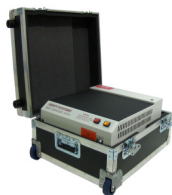
Also available—the V91 Transport Case

The SV91M is approved to the CESG degaussing standard at the Lower Level. This means any magnetic media (holding restricted or less) may be regarded as not protectively marked after being degaussed.